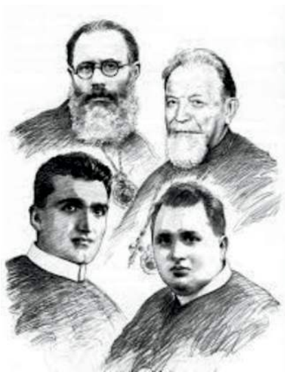
Blessed Bishop Nicholas Charnetsky, and Companions Redemptorist Martyrs of the Ukraine Feast Day June 27th.

Our Mother of Perpetual Help, pray for us.