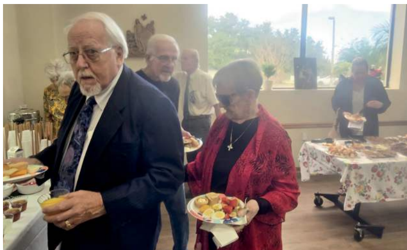
Friends enjoying fellowship and blessings!