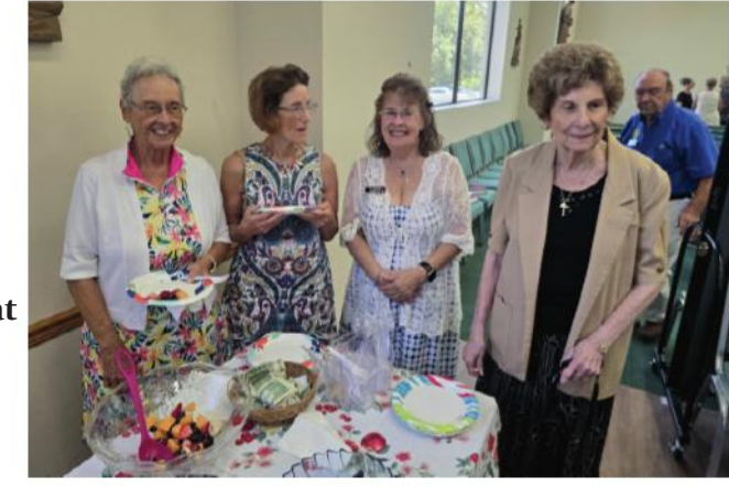
Until we eat again....