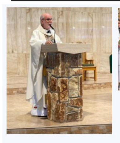
Celebrating our Catholic faith. Everyone had so much fun at the Saints' Museum.